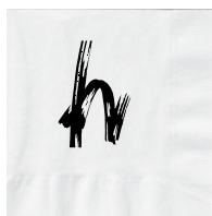
90 Degree Angle