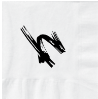
45 Degree Angle