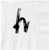
90 Degree Angle