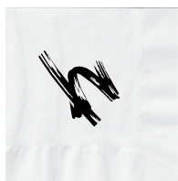
45 Degree Angle